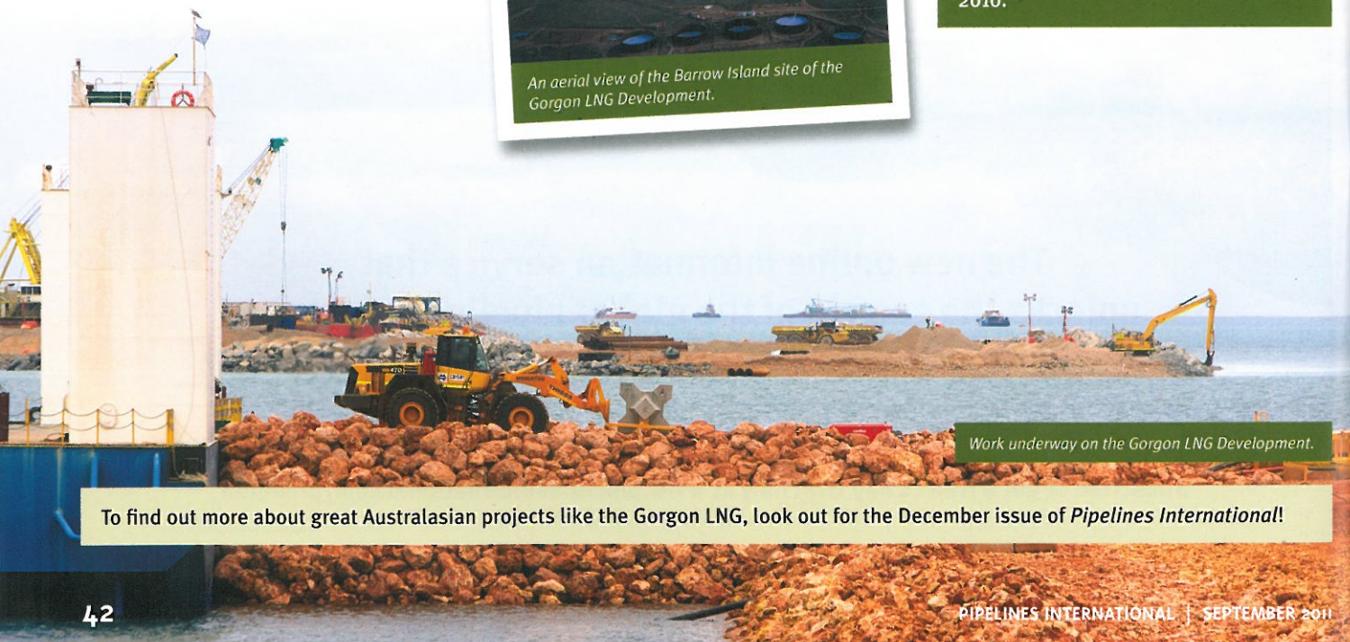
Work underway on the Gorgon LNG Development.

To find out more about great Australasian projects like the Gorgon LNG, look out for the December issue of Pipelines International!